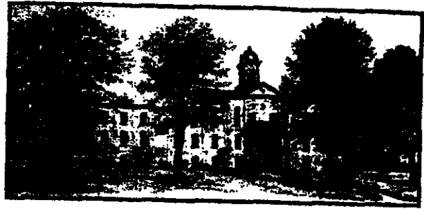
"The Peoples House"

511 West Second North Street • Morristown, Tennessee 37814 Phone (423) 586-1983 • Fax: (423) 587-9788